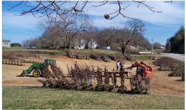
It's a pleasure to see the truck loads of nursery stock ready to hook up and head out of Warren County, TN. Photo taken at the Bob Young's Nursery loading dock located on Hennessee Bridge Rd.