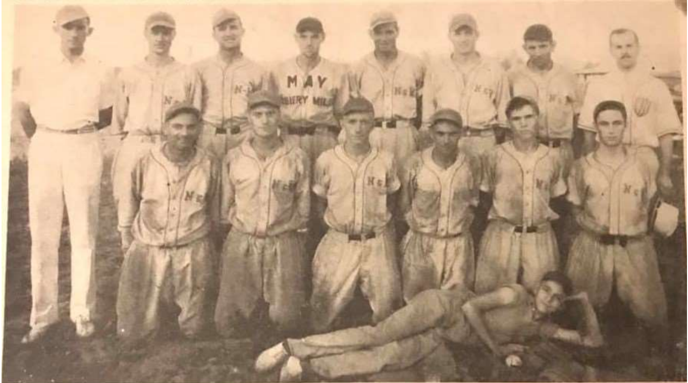
6-B—Southern Standard, Monday, September 5, 1938

You're invited to join our Facebook group, comment and submit photos and history.